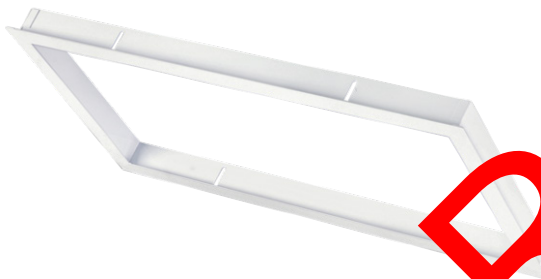
PLASTER RECESS FRAME (CODE: PRF31) DIMENSIONS: 330MM x 330MM x 40MM CUT OUT DETAILS: 310MM x 1210MM