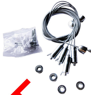
SUSPENSION MOUNT KIT (CODE: SPMK-PNLA)